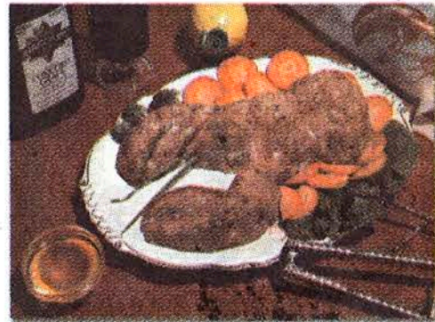
Chopped chicken livers in the form of a lobster. Enjoy!